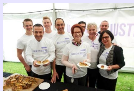
The Breakfast Club 2015