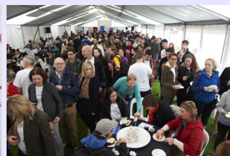
Enjoying the post-walk breakfast!