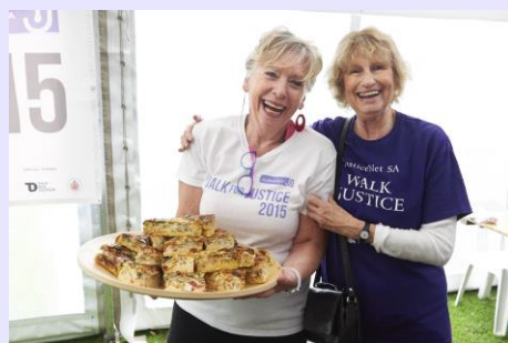
Maggie Beer and a fan