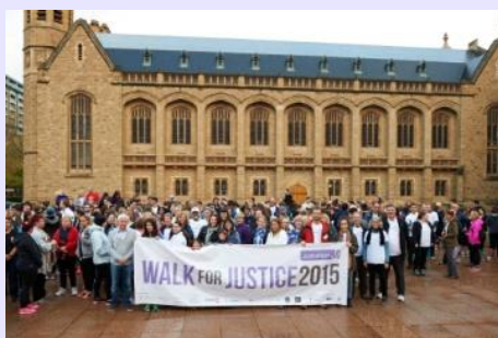
Start of the Walk for Justice 2015

The highlight of this year's Walk was the post-walk breakfast in Victoria Square. Having outgrown the Hilton lobby, walkers were rewarded with a sumptuous breakfast (and respite from the drizzle!) under the huge BankSA marquee in Victoria Square.